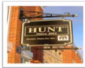
Example of a projecting sign

The Township encourages all businesses to install high quality signage that contributes to the character of King's vibrant communities, including projecting signs, wall signs with overhead lighting, and ground signs with architectural and landscaped features.