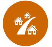
GROWTH MANAGEMENT SERVICES