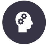
OFFICE OF THE CAO