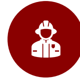
FIRE AND EMERGENCY SERVICES