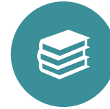
KING TOWNSHIP PUBLIC LIBRARY