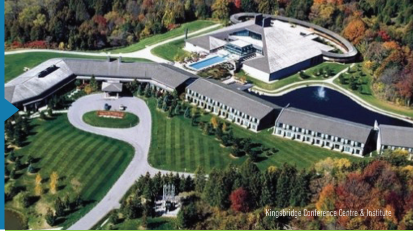
Kingsbridge Conference Centre & Institute

King City will be the new home of Magna International's head office, which will also include a research and development centre, increasing King City's daytime population by over 600. This is forecasted to require the support of over 1,200 jobs in King City as Magna employees drive an increase in demand for amenities, restaurants and services.